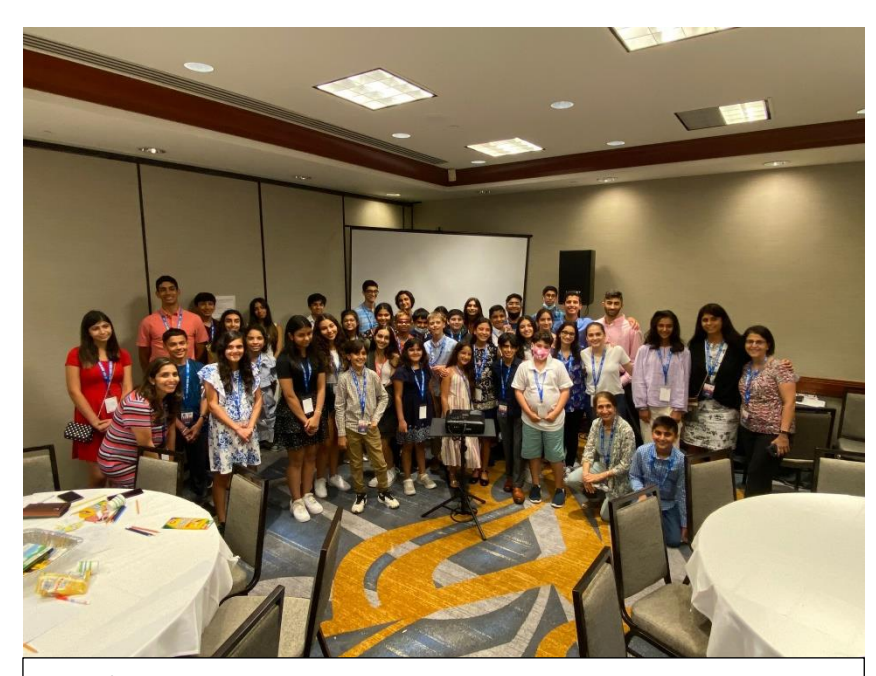
Teen/Tween participants with Volunteers and Adult Mentors

I was one of the volunteers at the Teens/Tweens Congress, and I spent a majority of my time there. There were countless activities and fun games! Together, with all the volunteers (kids and