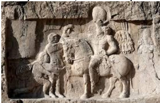
Naqš-e Rostam, Relief of Shapur I