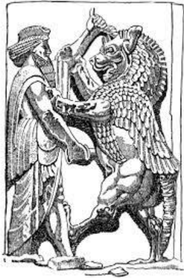
Cyrus the Great