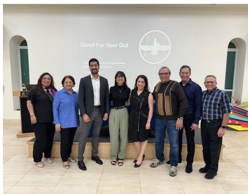
Well Attended Event