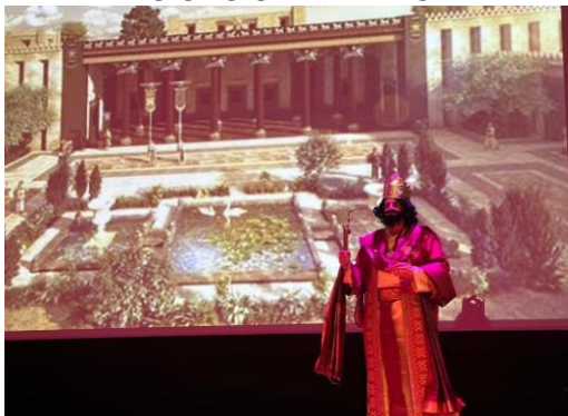
“Persian Garden” (the Avestan word “Pairidaēza”)