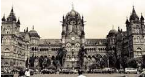
PARSIS OF 1800