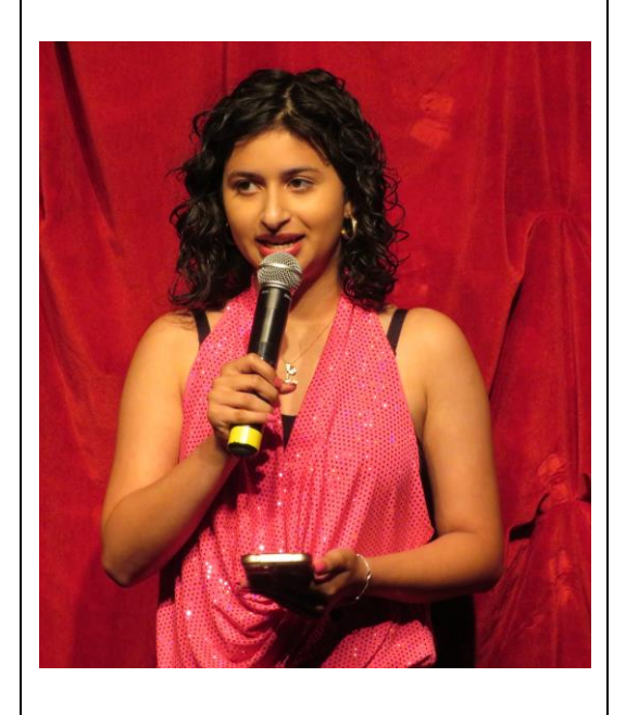
PERFORMERS - GROUP