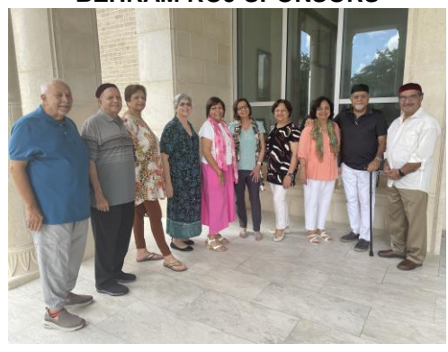
BEHRAM ROJ JASHAN ATTENDEES