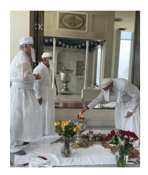
BEHRAM ROJ SPONSORS