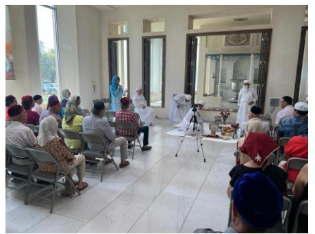
MEHERGAN & MAEDIOIZAREM GAHAMBAR VOLUNTEER SERVERS