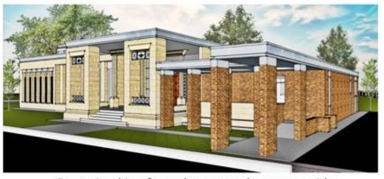
Front: Looking from the covered entrance side