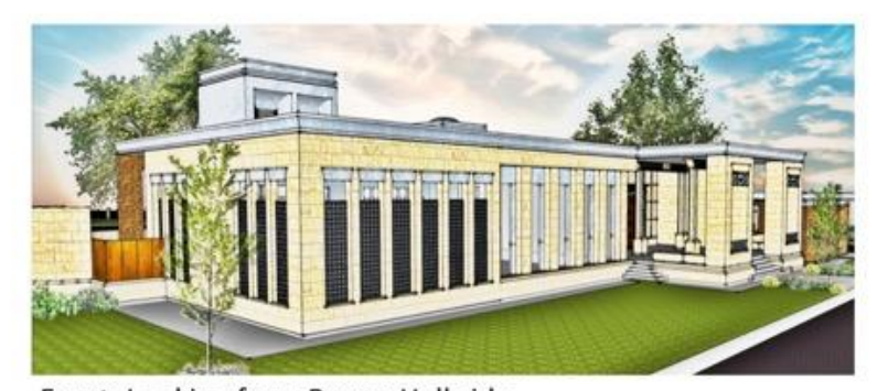
Front: Looking from Prayer Hall side