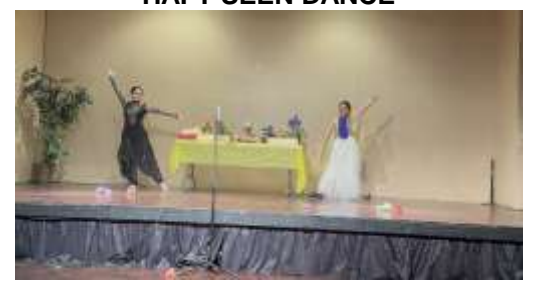
YOUNG PERFORMERS WITH VEHISHTA