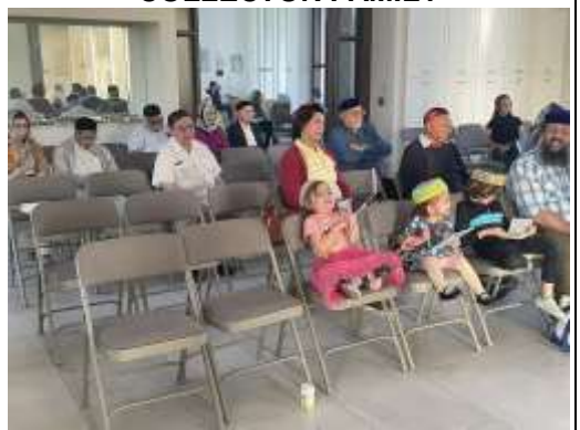
BEHRAM ROJ JASHAN ATTENDEES