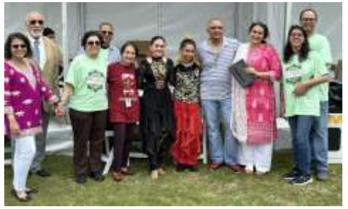
HAFT SEEN DANCE