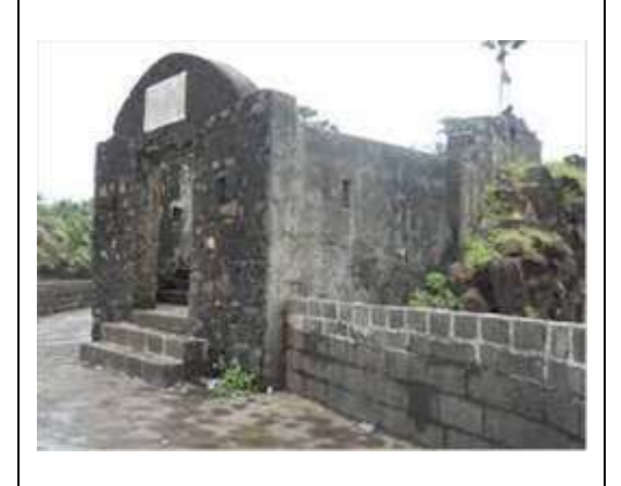
BHIKHA BEHRAM WELL