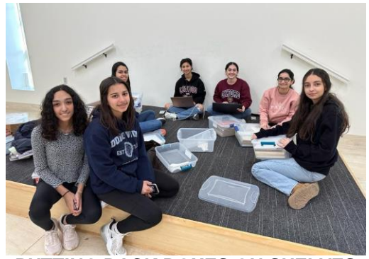
PUTTING BACK BOXES ON SHELVES