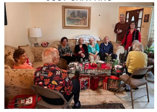
WHAT IS FOB