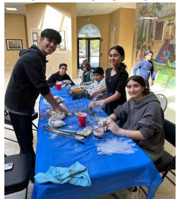
MORE PICTURES ON THE LAST PAGE