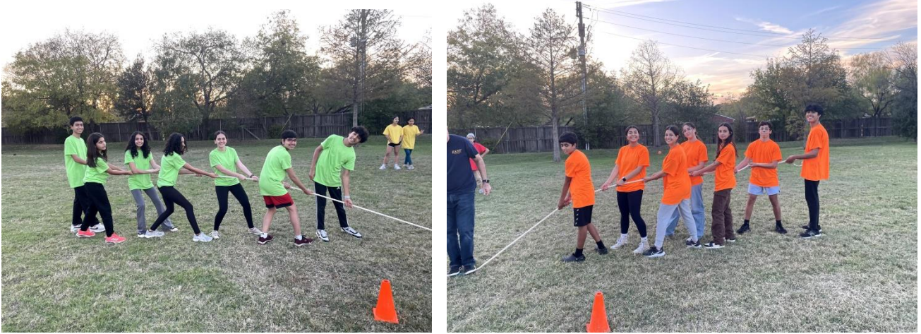
TUG OF WAR - GREEN VS RED TEAM