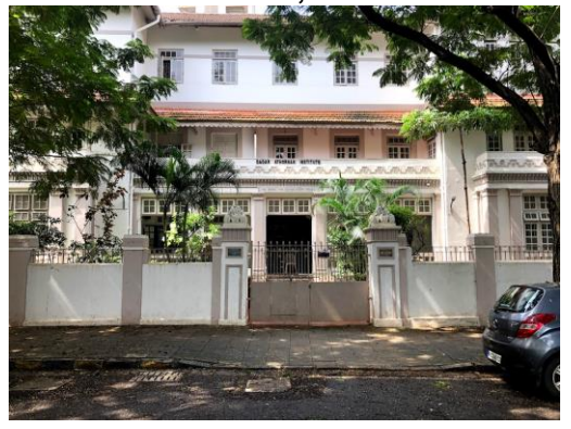
Bai Avanbai Petit Girls' Hostel