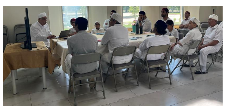
Young Mobeds in Training

Muktad prayers have started from August 6 through August 15, 2023. Please feel free to attend the prayers at the Atash Kadeh or via the Zoom link. Thank you all for your continued support and participation.