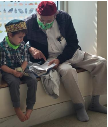
YOUNG MOBED - TRAINING FOR BOYE CEREMONY