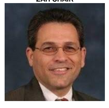
INVESTMENT MANAGEMENT TEAM