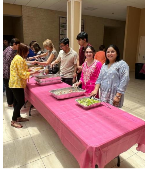
What can we serve you?