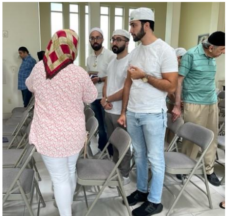
Iranian Mubeds from Florida