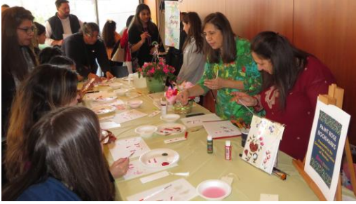
SENIORS - LETS GO TO ASIA SOCIETY