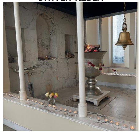
ATASH KADEH FOURTH ANNIVERSARY JASHAN