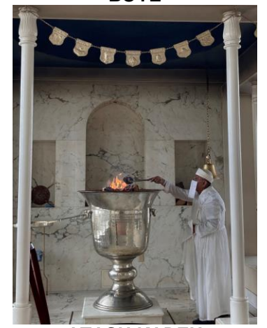
ATASH KADEH FLOWERS IN BLOOM