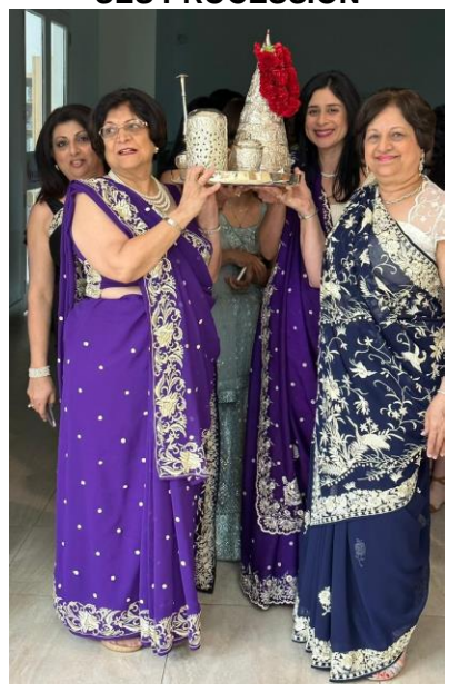
SUNDAY SCHOOL TEACHERS FELICITATED