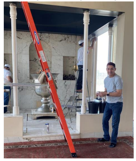
DIVA LIT KEBLA