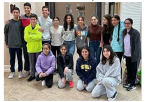
ZAH Z-CAMP AND NAMC JOIN HANDS