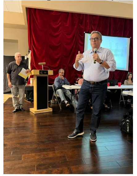
ZAH AGM Members