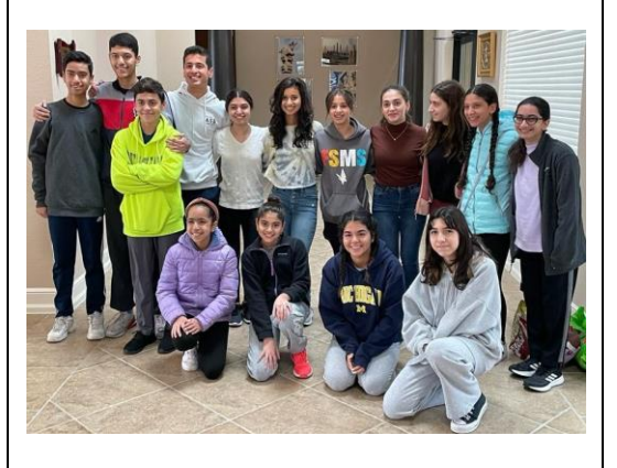
Red Team – Lalios