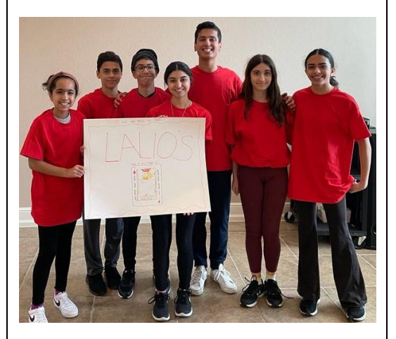
Orange Team – Soaring Comets