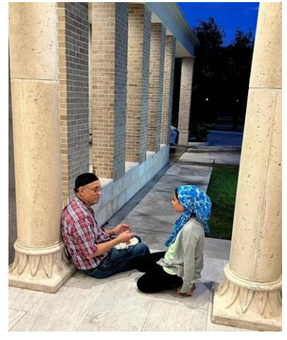
What could they be talking about? Can anyone guess?