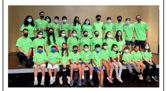
Activity - 2021