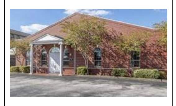
CHAPEL OF ETERNAL PEACE