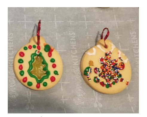
2<sup>nd</sup> Place – Darius Aga

COOKIE DECORATION 1<sup>st</sup> Place – Cyrene & Zenia Nariman Youngest Kids' Group