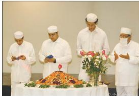
Zoroastrian priests commencing the ceremony with prayer.

(The Book of Kings), written by the Persian poet Fir-