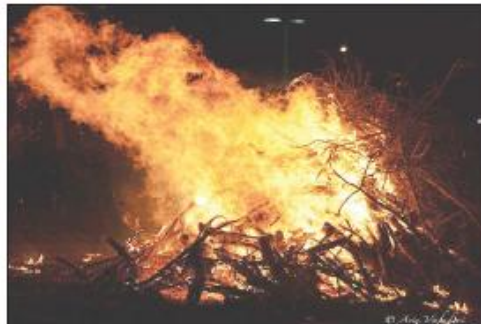
The bonfire symbolizing the human yearning for the higher life.