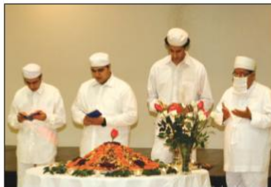
Ceremony begins with prayers by Zoroastrian priests.

Jashn-e (Festival of) Sadeh (hundred), considered as one of the biggest Persian festivities since ancient times, actually refers to one hundred days and nights to the coming New Year.