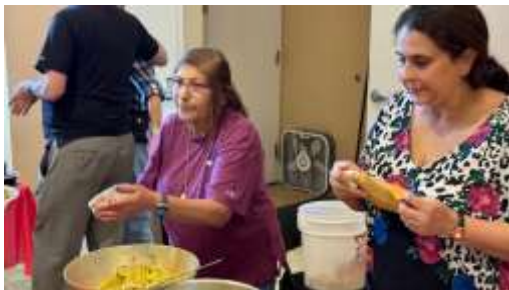
YOUTH GROUP TABLE