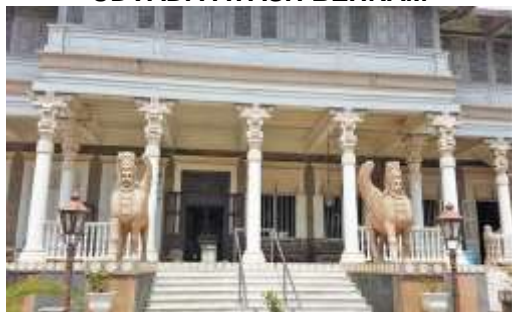
UDVADA ATASH BEHRAM