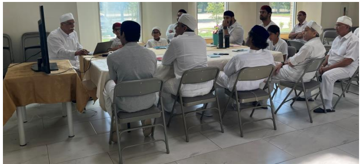
Young Mobeds in Training

Muktdad prayers have started from August 6 through August 15, 2023. Please feel free to attend the prayers at the Atash Kadeh or via the Zoom link. Thank you all for your continued support and participation.