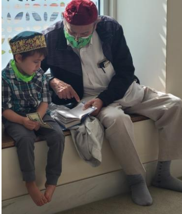
YOUNG MOBED - TRAINING FOR BOYE CEREMONY