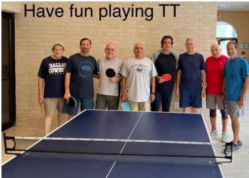
Retirees having fun playing Table Tennis