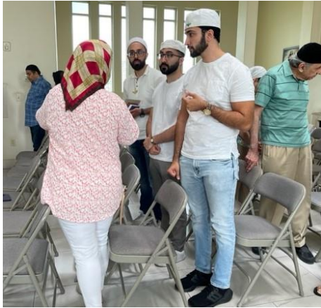
Iranian Mubeds from Florida