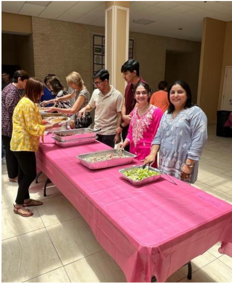
What can we serve you?