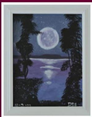
Midnight Beauty 9" x 12"

Nature inspired me to paint this picture. I love nature and all things created by Ahura Mazda. There is so much beauty around us and it makes me feel happy and calm. This painting was challenging for me as an artist as I had to come up with different shades of color to get the perfect image of my vision.