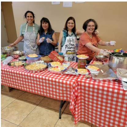
Ladies at Bhel Puri table