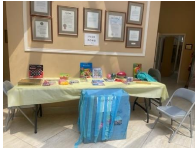
Ever popular Fish Pond