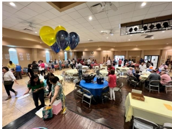
Main Hall Throbbing with Activities