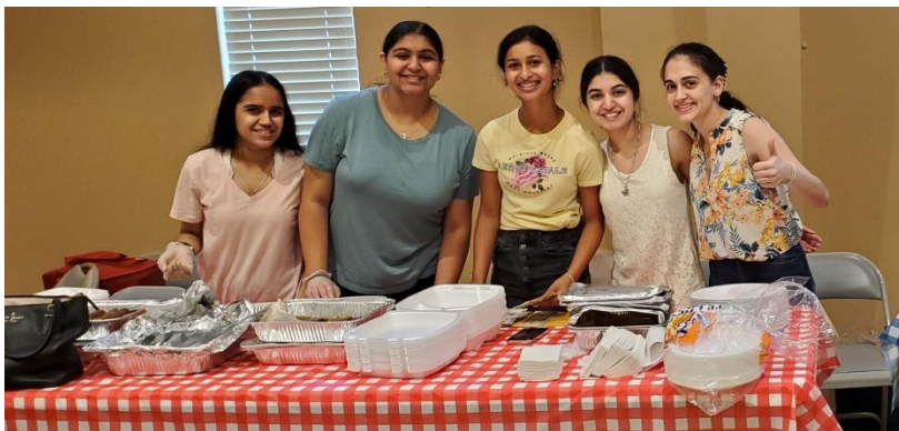
Snacky items for sale by Sunday School Youth Group