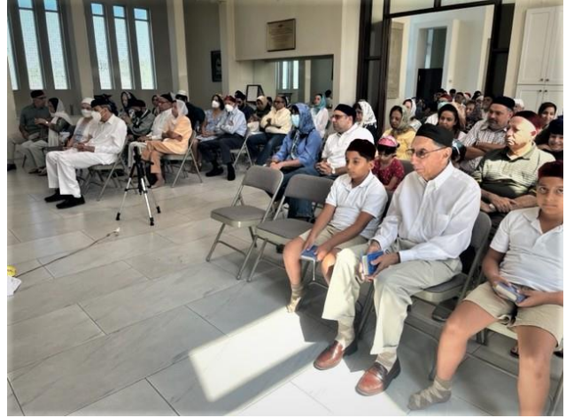
Some attendees at the Jashan