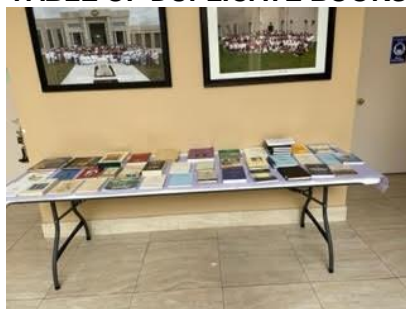
TABLE OF DUPLICATE BOOKS