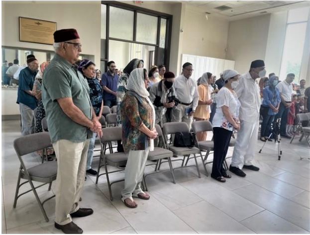
Hambandagi after the Jashan