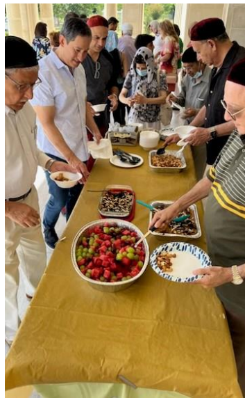
Partaking of the Chasni