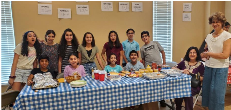
Snacky items for sale by Sunday School Middle Group