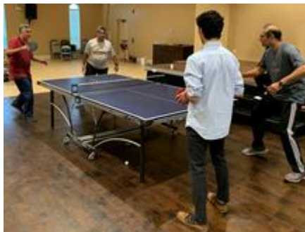
TABLE TENNIS PICTURE FROM NOVEMBER 2021 SPORTS DAY