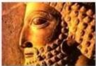
CONGRESS 2000 LEGACY