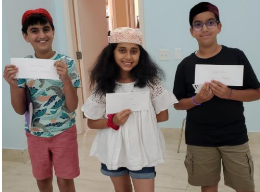
Darien 2 nd Place