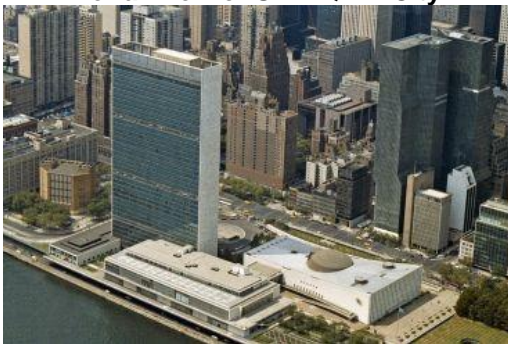
Aerial View of UN HQ NY City

We await the release of the book and your report from the UN conference.