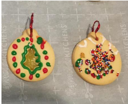
2 nd Place – Darius Aga